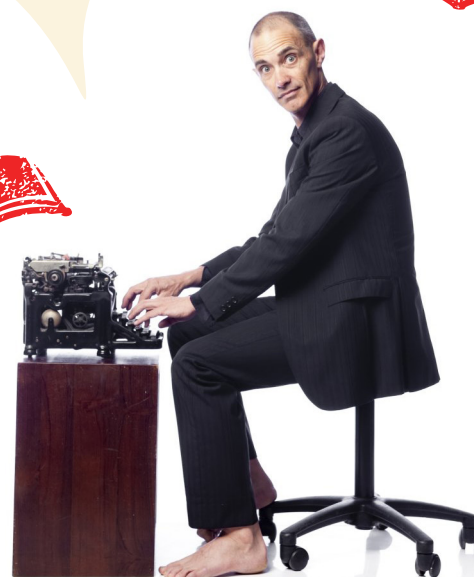
ANDY GRIFFITHS, AMBASSADOR